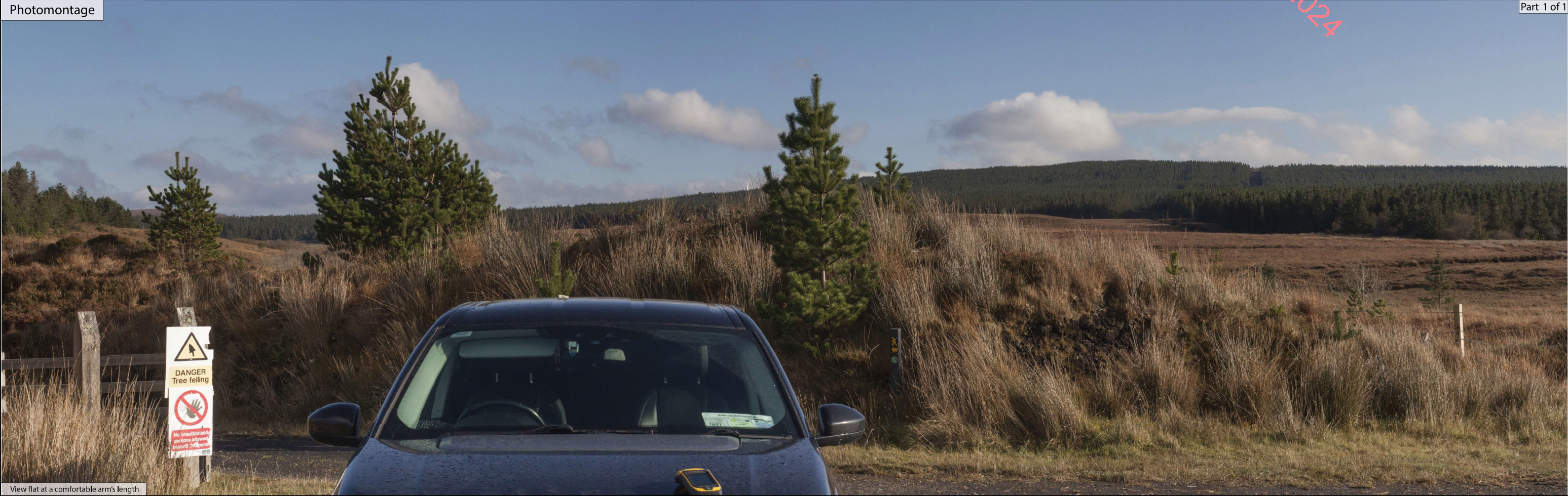
View flat at a comfortable arm's length This planar projection panorama has been captured, prepared and presented in accordance with the guidance set out in the Scottish Natural Heritage 2017 guidance 'Visual Representation of Wind Farms'.