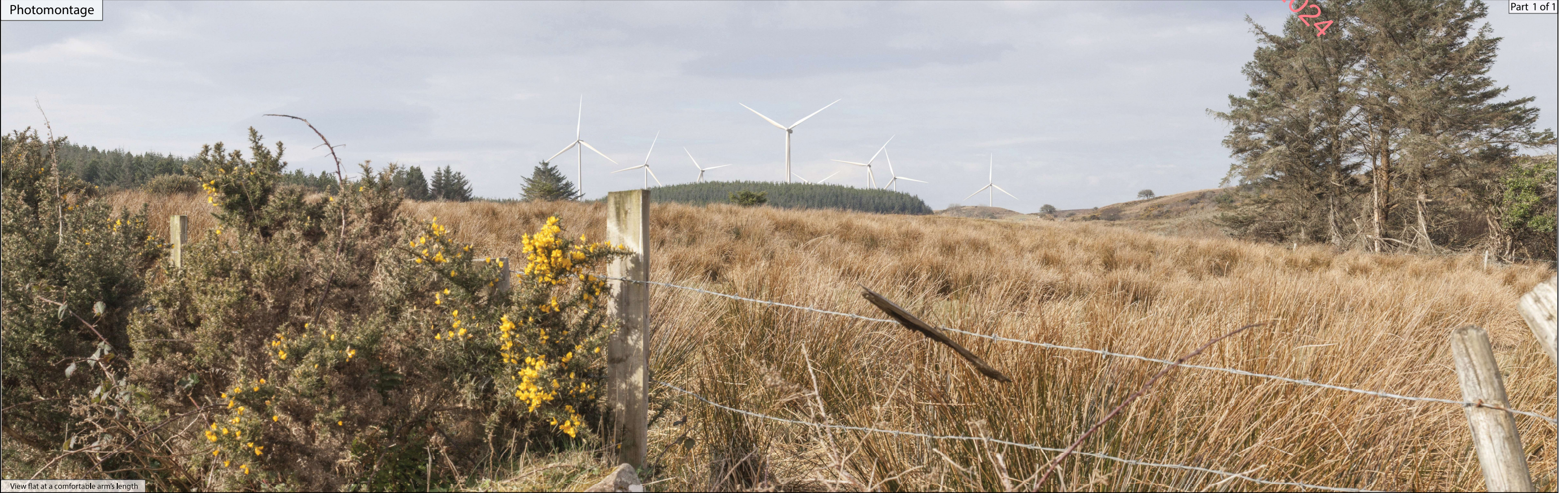
View flat at a comfortable arm's length

This planar projection panorama has been captured, prepared and presented in accordance with the guidance set out in the Scottish Natural Heritage 2017 guidance 'Visual Representation of Wind Farms'.